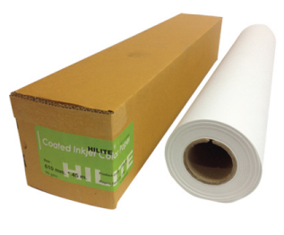
INKJET & GLOSSY PHOTO PAPER